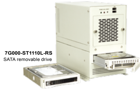
3.5" SATA removable drive bay compatible