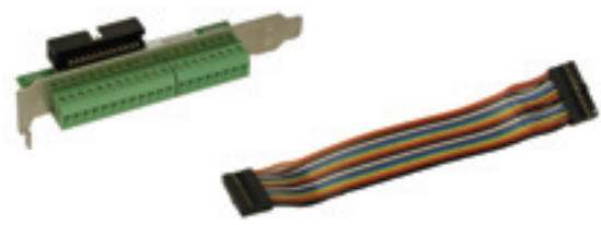
IVC-200G-RS-R20 GPIO-daughter board and cable