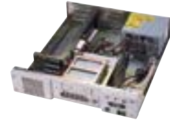
RACK-210W Top View