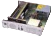
RACK-200W Top View