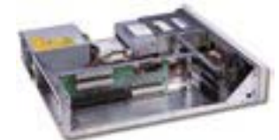
RACK-220AW Top View