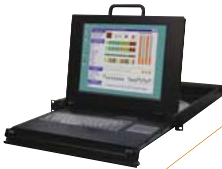
Individual for LCD display and keyboard module