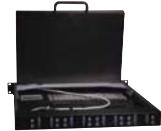
No special cables required, up to 8 computers connection!