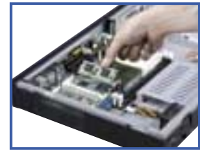
Expendable two Socket-PCI for add-on LAN module