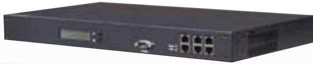
FWAP-3680L Rackmount Solution