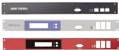
The changeable front panel and cover provides easier hardware customization