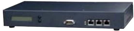
FWAP-2680L Desktop Solution