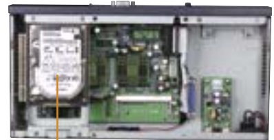
One 2.5" HDD drive bay